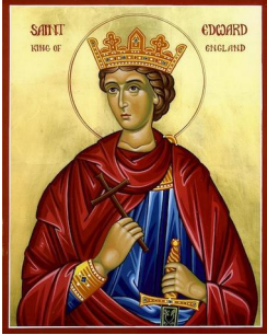
Edward of England

Edward of England, King and martyr (978)